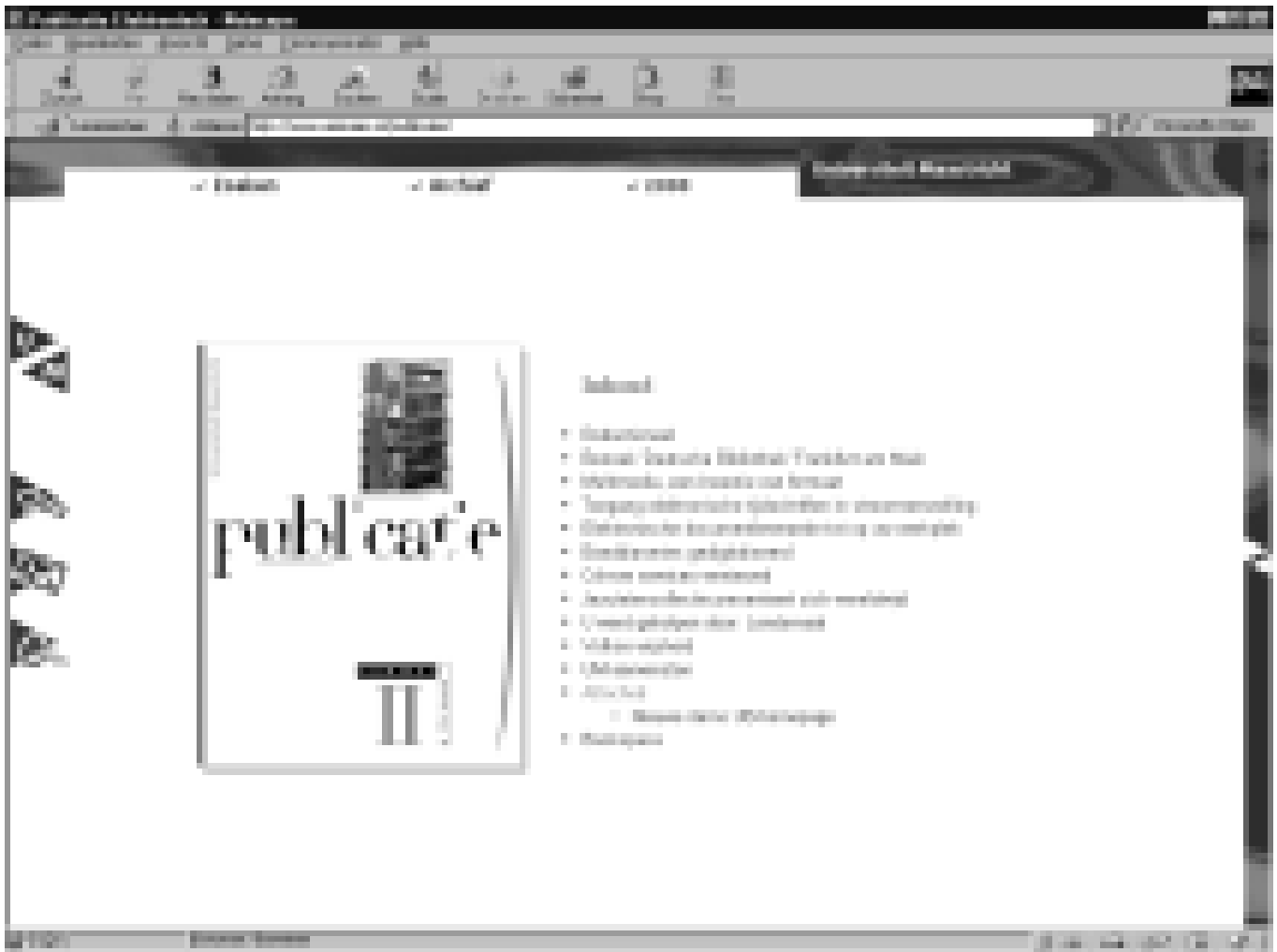
Figure 2: Home Page of the Maastricht University Library

culum. Some of these modules will be automated and offered to the student as part of the digital library services.